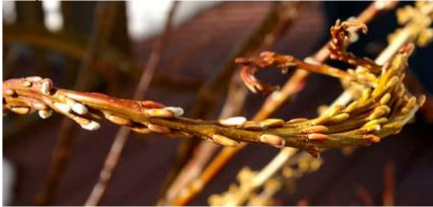
My fasciated pussywillow branches are starting to open.

3. Check your pussywillows. Mine are just beginning to crack and I am bringing them in the house, opening them all the way in water, and then dumping out the water so that they dry as a catkin. If you leave them in water, the fuzzy catkin becomes a yellow flower and they won't last.