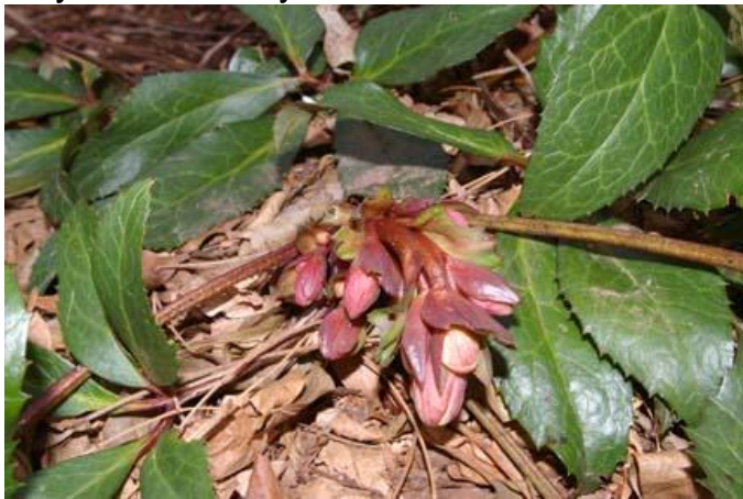
Hellebore buds are starting to show in my shade garden

4. Check your Hellebores. Many of mine are budded. I peek at them, say hello, then tuck the leaves and branches back around them if it looks like it's going to be very cold or snowy.