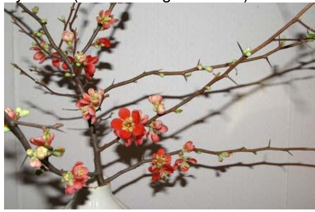
You can force quince branches now

(Jasminum nudiflorum), and winter honeysuckle (Lonicera fragrantissima) and bring them in the house to force into bloom. Any shrubs that bloom in March or April will force well. The general rule is to cut them six weeks before their regular bloom time.