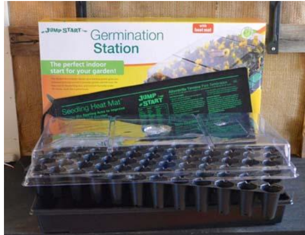
Seedy Sunday Special:$5 off Germination Station-see coupon below

We know how important this day is to you because so many of you said goodbye at Christmas time by saying... "See you on Seedy Sunday!". It truly is a celebration. Happy, excited gardeners cram the shop from morning till late in the afternoon, shopping seeds, talking gardens, and make decisions that will determine what their gardens will be like for the growing season ahead. My staff is very busy restocking the organic seed starting soil, trays, cow pots, heat mats, soil thermometers, organic fertilizers, and everything else needed to get growing. I take on the job of loading the racks. We have SIX seed suppliers this year and I have