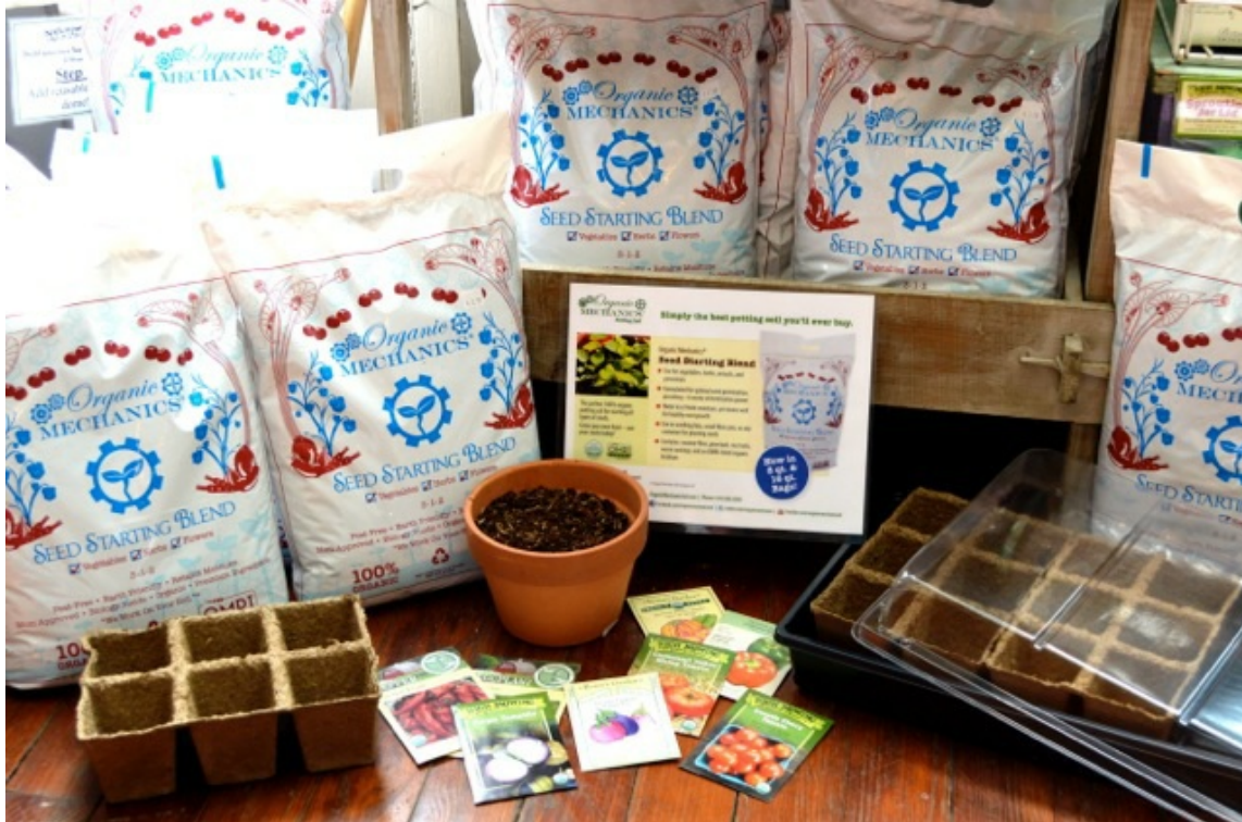
ORGANIC seed starting supplies fill the store

Want to know a REALLY good way to chase away the snowstorm blues? Jump onto the Natureworks website and register for Grow Day which is coming up on Saturday, March 25th. My staff and I are planning some wonderful new workshops. I will even be sharing with you a presentation of the edible gardens I visited in England last summer. Monday, March 20th is the last day to get the best price of $35 when you pre-register in advance. After that, walk-ins are welcome at the price of $40, Click Here .