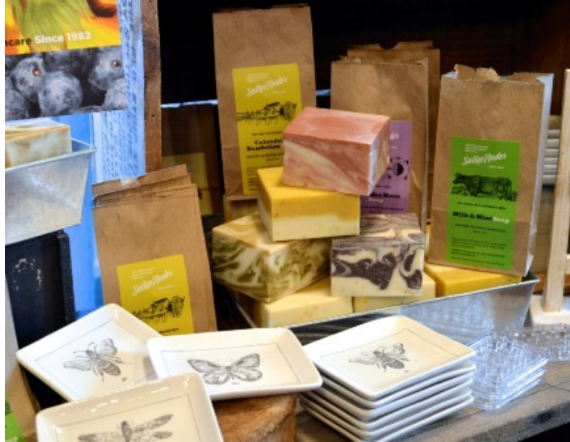
Check out our new organic soaps: Calendula Dandelion, Milk and Mint, Lavender Moon, and Almond Goat Milk