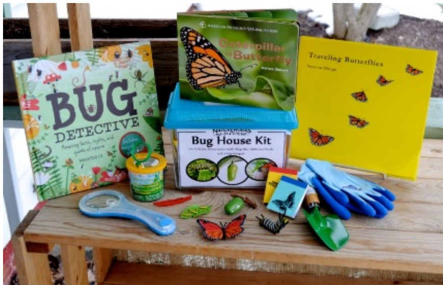
We want the younger generation to also know and love our pollinators too

From organic soaps made in the USA from the finest essential oils, to eggshells (from Diane's chickens!) filled with pansies and set into vintage style egg cups, from cute containers filled with fresh flowering plants to new gardens hats, tools, and gloves, we have just what you need to think spring .