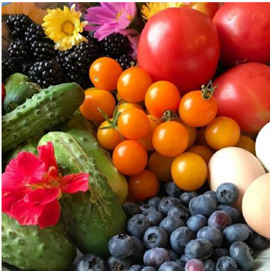
Homegrown food from Diane's garden last summer. #growmorefood

Diane and Amber also wanted me to mention that they have gathered lots of merchandise that they don't want to have to move or display again and have created an awesome tag sale . I can't bear to look at the prices, but I guess they mean business, let's get this stuff out of here because our shipping and receiving porch is so full, you can barely open the door! The NEW merchandise yet to be unpacked is headed up to the CT Flower and Garden Show which is only a few weeks away, February 22-25th. Yes, we still have discount flower show tickets for sale.