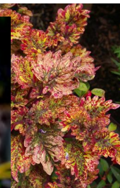
'Willwood Driveway' container, sun or shade.

One good reason to include colorful foliage plants- beautiful Virginia bluebells (Mertensia) go dormant in the summer. The golden ornamental grass hides the gap and looks so pretty until hard frost.